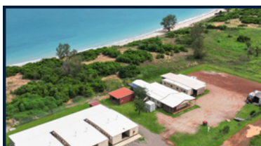
WALLABY BEACH CAMP | $200 PER NIGHT